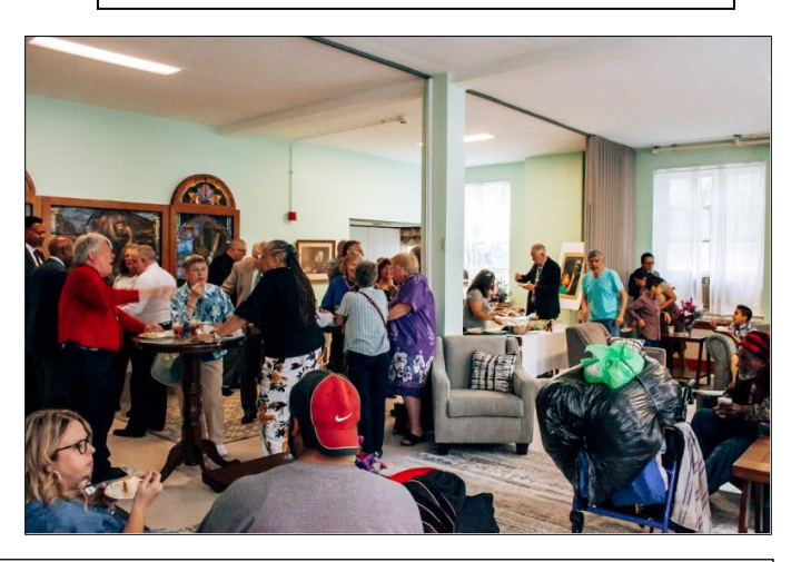
We love good reasons to celebrate! We celebrate the installation, and we celebrate the continuing success of our capital campaign!