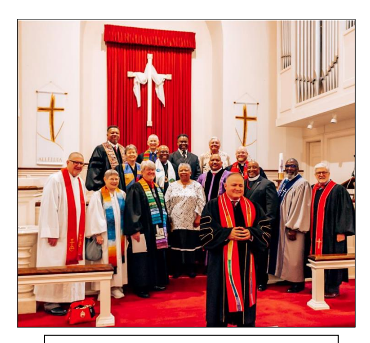
Ministers from near and far came to support People's Church revitalization project