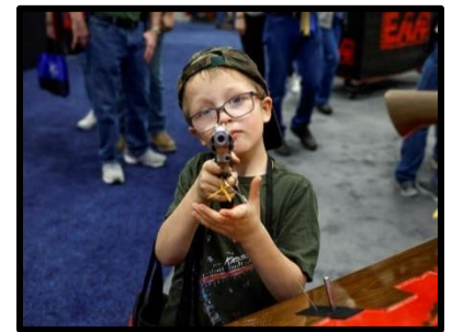
At a recent meeting of the National Rifle Association

Claiming a “God-given right” to guns would be laughable if it weren't so deadly. If these conservative politicians insist on spouting pro-gun policies, they should at least leave our all-loving God out of it.